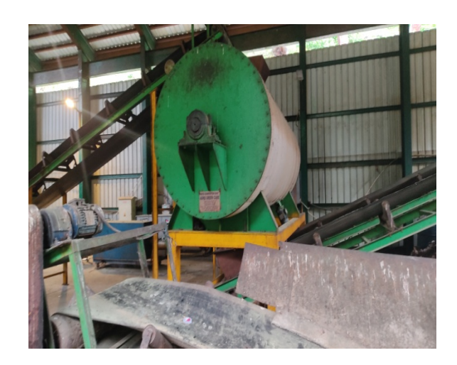
Fig. : Solid Waste Treatment Plant (SWTP), Pahalgham