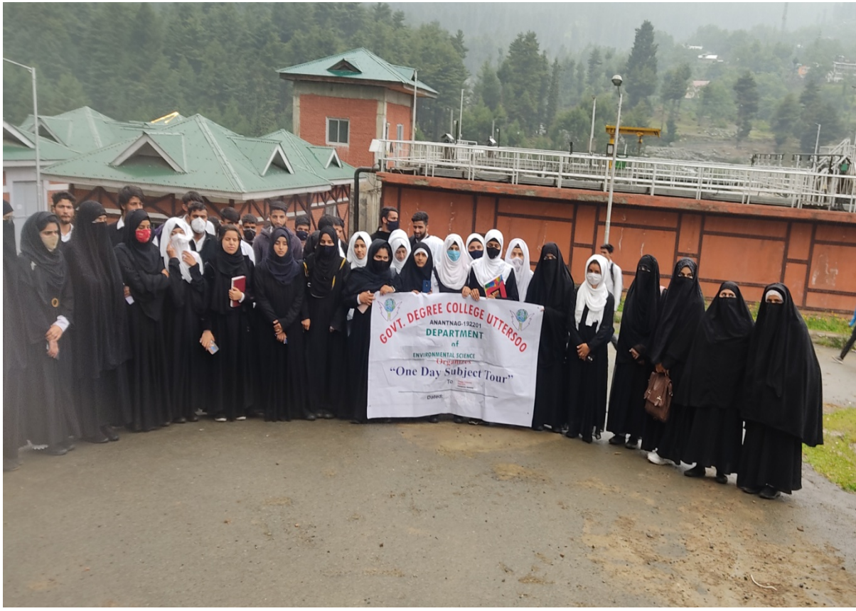
Sewage Treatment Pla