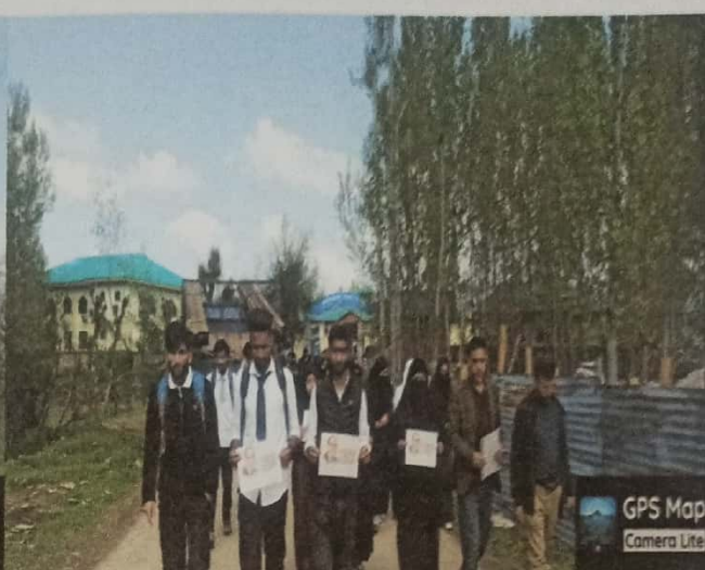
P853+8xg, Uttersoo, 192201

Latitude 33.7092633333333° Longitude 75.3042766666667° Local 10:57:04 AM Altitude 1740 m GMT 05:27:04 AM Saturday, 12.04.2025