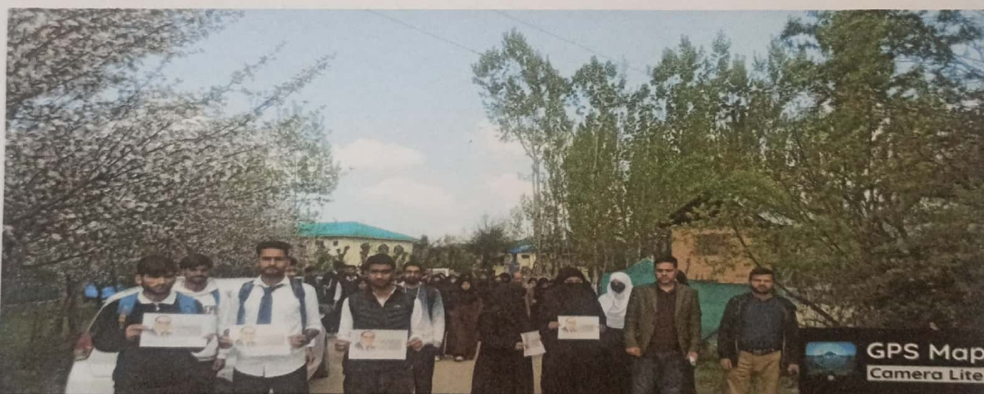
P853+8xg, Uttersoo, 192201

Latitude 33.7085916666666° Longitude 75.3049049999999° Local 10:59:04 AM Altitude 13.35 m GMT 05:29:04 AM Saturday, 12.04.2025