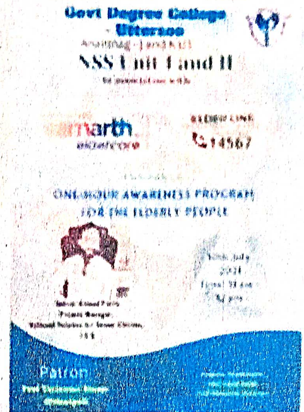
FLYER FOR THE PROGRAM