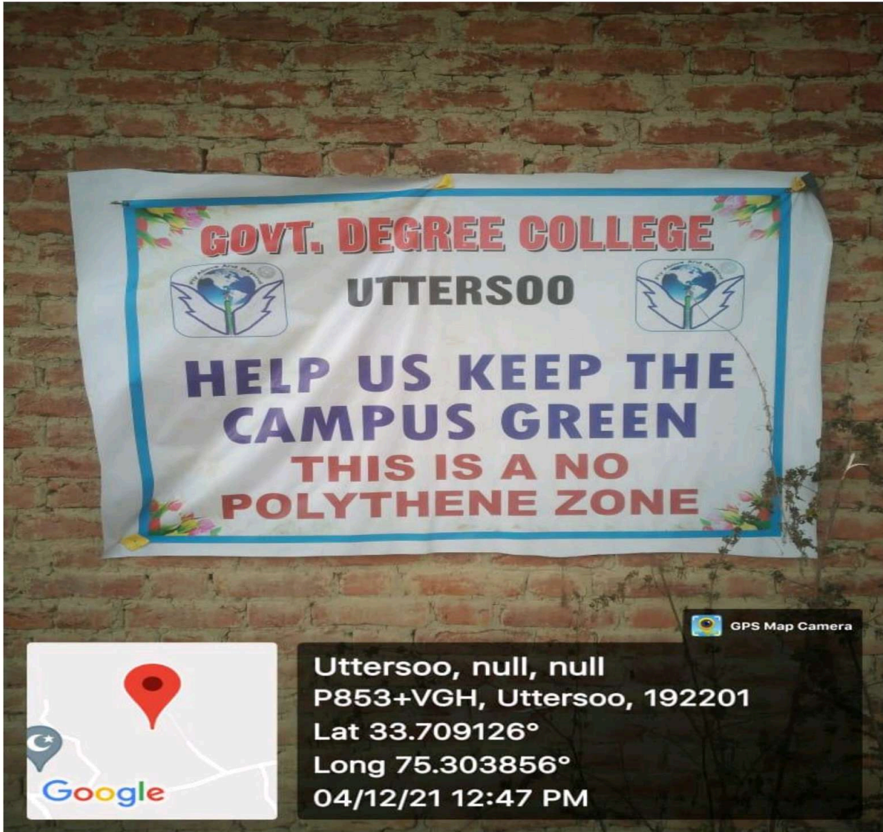
Figure 6: WARNING AGAINST PLASTIC/ POLYTHENE USE

E: gdc.uttersoo@gmail.com W: www.gdcuttersoo.ac.in