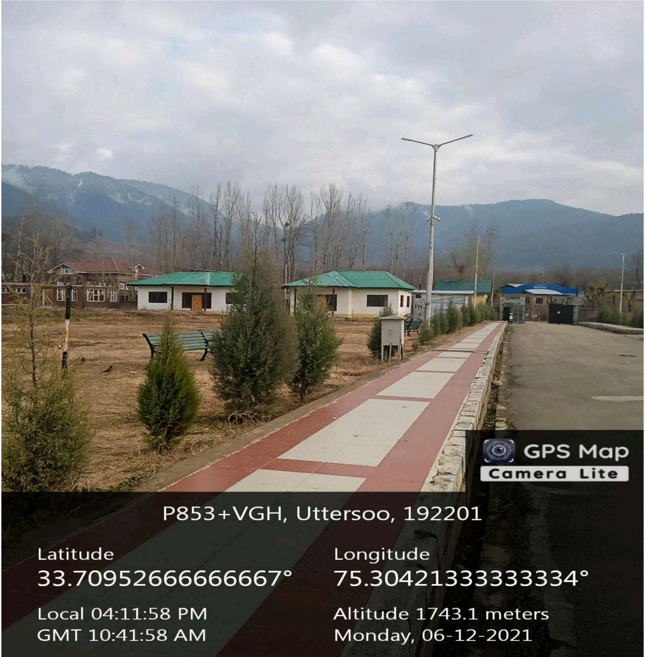
Figure 4: LANDSCAPING WITH TREES/ PLANTS

E: gdc.uttersoo@gmail.com W: www.gdcuttersoo.ac.in