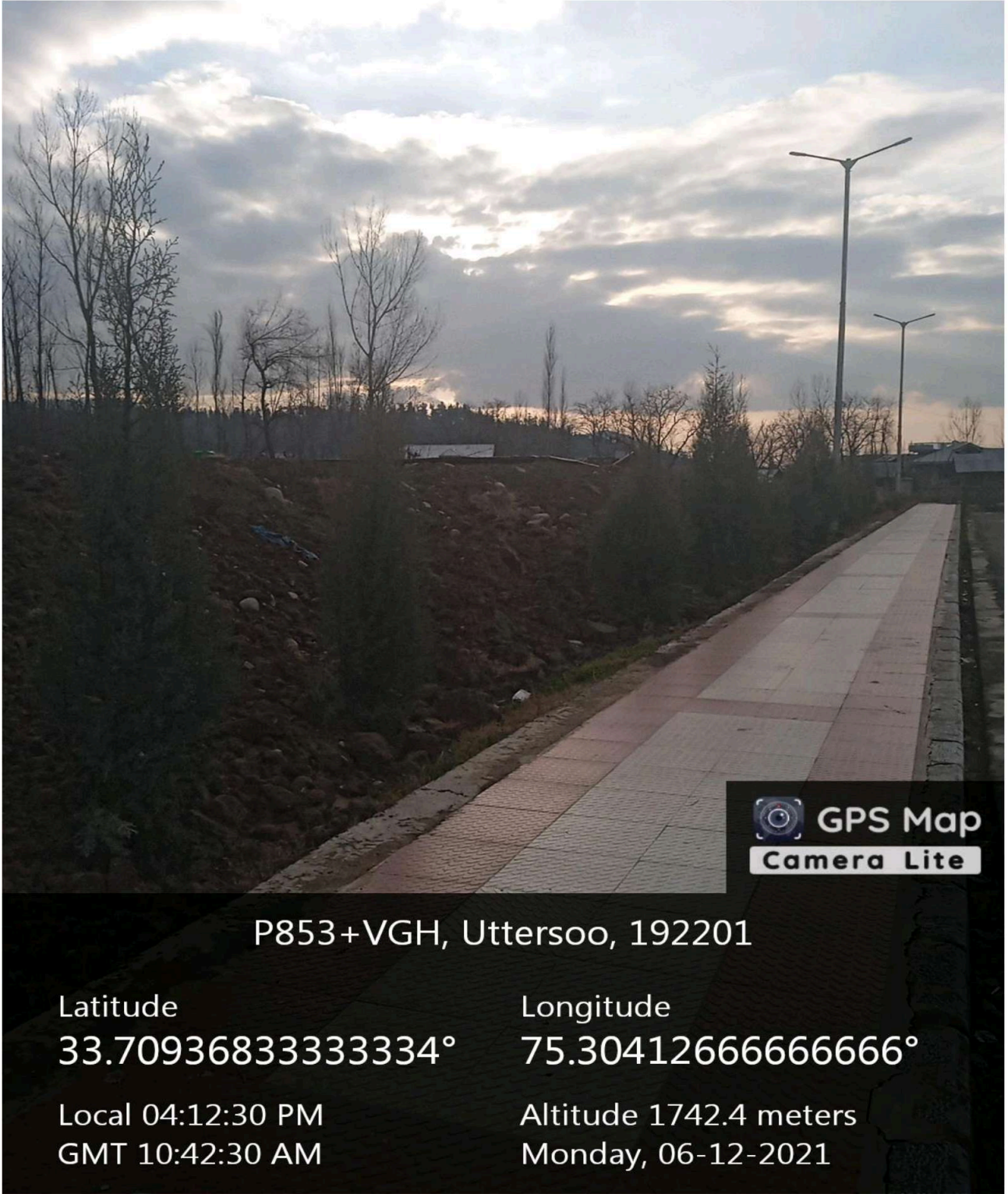
Figure 2: LANDSCAPING WITH TREES/PLANTS

E: gdc.uttersoo@gmail.com W: www.gdcuttersoo.ac.in